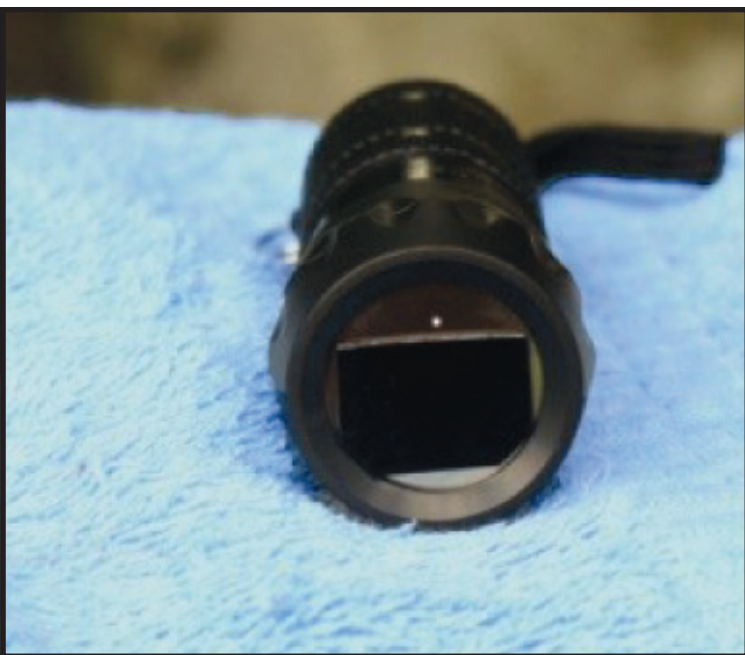
Image 2 - One Star Lit

for collimating my telescopes. This little device is pretty slick. At first glance it looks like nothing more than a little flash light. However, when you look a little closer you realize that it's got 5 really bright LEDs and 5 pinholes of varying sizes, as shown in the "All Stars Lit," (Image 1). You only need to use one of the stars at a time. You choose which opening to use based on the size and focal length of your telescope. The device comes with a small magnetic mask that you place on the front to block all but the one "star" you are using at the moment. You can see the mask in the "One Star Lit," (Image 2).